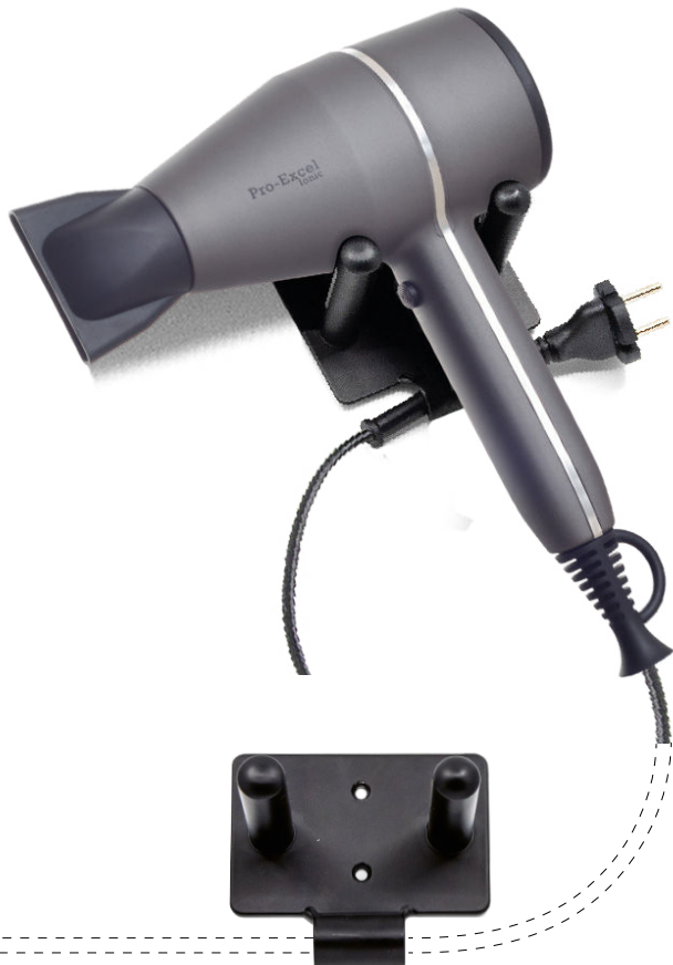
ANTI-THEFT Wall holder "Vane" with cable lock

Professional hand-held hairdryer with anti-theft wall holder "Vane" (optional)